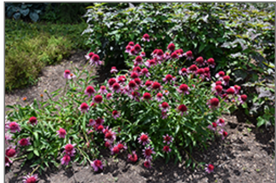
Double Scoop Bubble Gum Coneflower in bloom