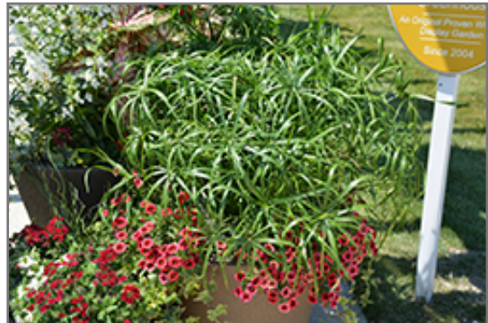
Baby Tut Umbrella Grass