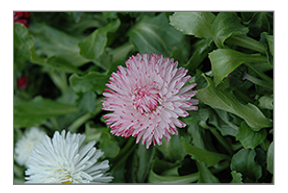
Enorma Pink English Daisy flowers

Enorma Pink English Daisy is recommended for the following landscape applications;