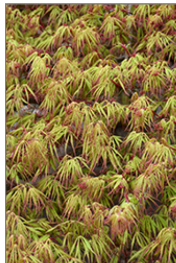
Spring Delight Japanese Maple foliage

Spring Delight Japanese Maple is recommended for the following landscape applications;