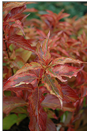
My Monet Sunset Weigela in fall

My Monet Sunset Weigela makes a fine choice for the outdoor landscape, but it is also well-suited for use in outdoor pots and containers. It is often used as a 'filler' in the 'spiller-thriller-filler' container combination, providing a mass of flowers and foliage against which the thriller plants stand out. Note that when grown in a container, it may not perform exactly as indicated on the tag - this is to be expected. Also note that when growing plants in outdoor containers and baskets, they may require more frequent waterings than they would in the yard or garden.