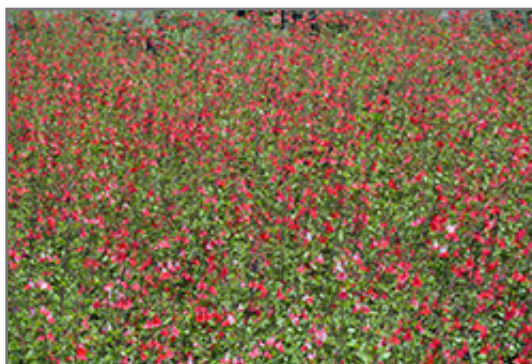
Hot Lips Sage in bloom