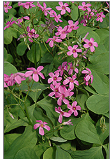
Pink Wood Sorrel flowers

Pink Wood Sorrel is recommended for the following landscape applications;