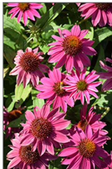
PowWow Wild Berry Coneflower flowers