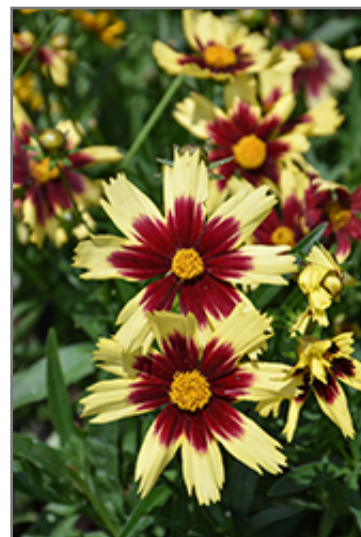
Cosmic Eye Tickseed flowers

Cosmic Eye Tickseed is recommended for the following landscape applications;