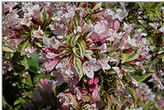
Rainbow Sensation Weigela flowers

Rainbow Sensation Weigela is recommended for the following landscape applications;