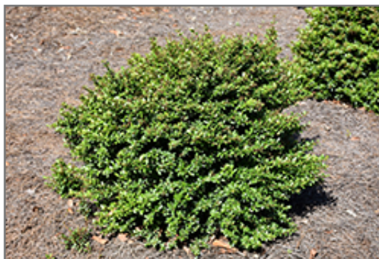
Whorled Class Viburnum