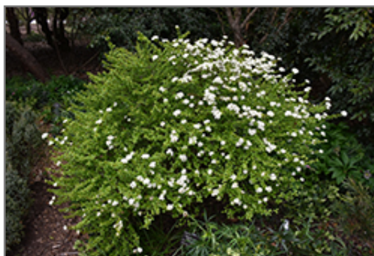
Whorled Class Viburnum in bloom