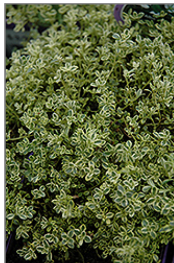
Highland Cream Creeping Thyme