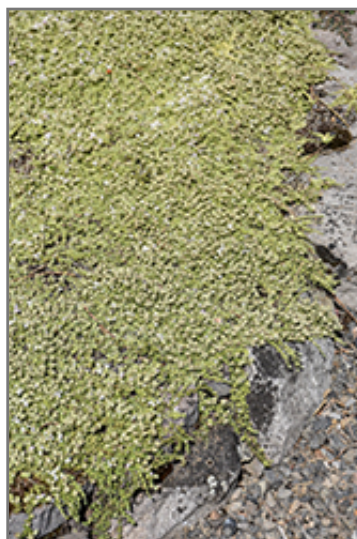
Highland Cream Creeping Thyme