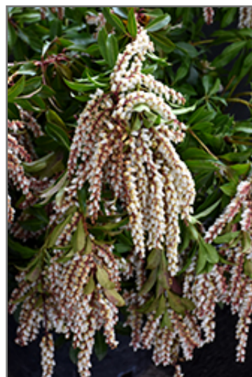
Mountain Fire Japanese Pieris flowers