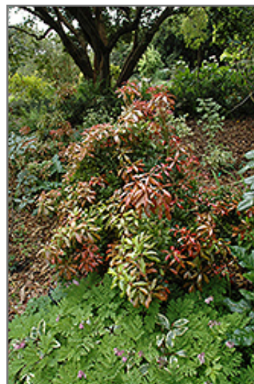
Mountain Fire Japanese Pieris

This shrub does best in full sun to partial shade. It requires an evenly moist well-drained soil for optimal growth, but will die in standing water. It is very fussy about its soil conditions and must have rich, acidic soils to ensure success, and is subject to chlorosis (yellowing) of the foliage in alkaline soils. It is somewhat tolerant of urban pollution, and will benefit from being planted in a relatively sheltered location. Consider applying a thick mulch around the root zone in winter to protect it in exposed locations or colder microclimates. This is a selected variety of a species not originally from North America, and parts of it are known to be toxic to humans and animals, so care should be exercised in planting it around children and pets.