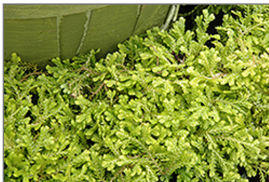
Golden Spikemoss foliage