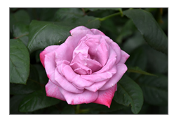
Paradise Rose flowers

Stunning, lavender blooms edged in pink, with a pleasing rose fragrance, complimenting rich green foliage; great for the garden, containers, or along borders; disease resistant