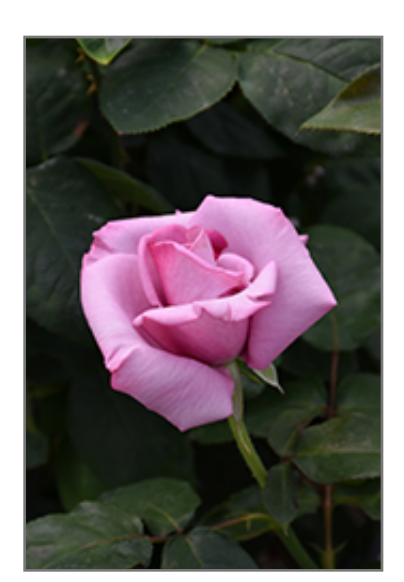
Paradise Rose flower buds

This shrub will require occasional maintenance and upkeep, and is best pruned in late winter once the threat of extreme cold has passed. Gardeners should be aware of the following characteristic(s) that may warrant special consideration;