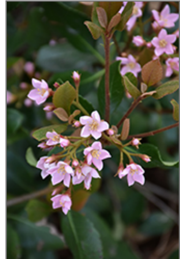
Pink Lady Indian Hawthorn flowers

Pink Lady Indian Hawthorn is recommended for the following landscape applications;