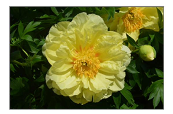
Sequestered Sunshine Peony in bloom