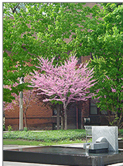
Eastern Redbud (tree form) in bloom

Eastern Redbud (tree form) is recommended for the following landscape applications;