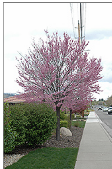
Eastern Redbud (tree form) in bloom

This tree does best in full sun to partial shade. It prefers to grow in average to moist conditions, and shouldn't be allowed to dry out. It is not particular as to soil type or pH. It is highly tolerant of urban pollution and will even thrive in inner city environments, and will benefit from being planted in a relatively sheltered location. Consider applying a thick mulch around the root zone in winter to protect it in exposed locations or colder microclimates. This is a selection of a native North American species.