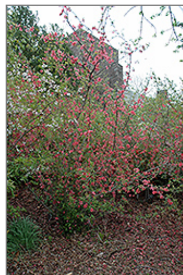
Pink Lady Flowering Quince in bloom