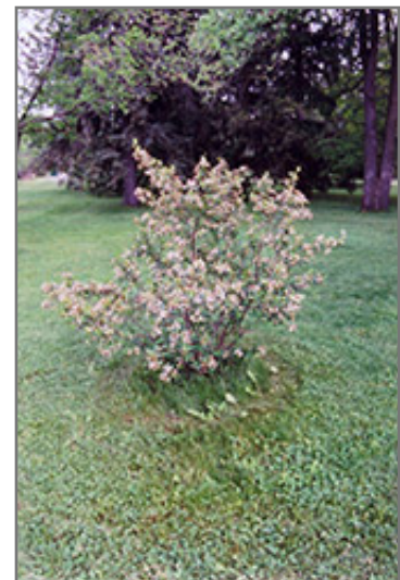
Black Chokeberry in bloom