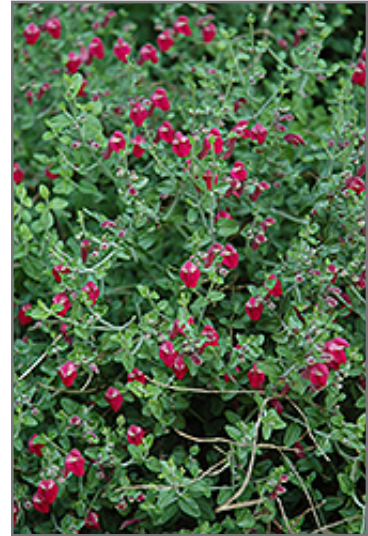
Texas Rose Pink Skullcap flowers

Texas Rose Pink Skullcap is recommended for the following landscape applications;