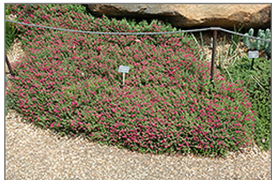
Texas Rose Pink Skullcap in bloom