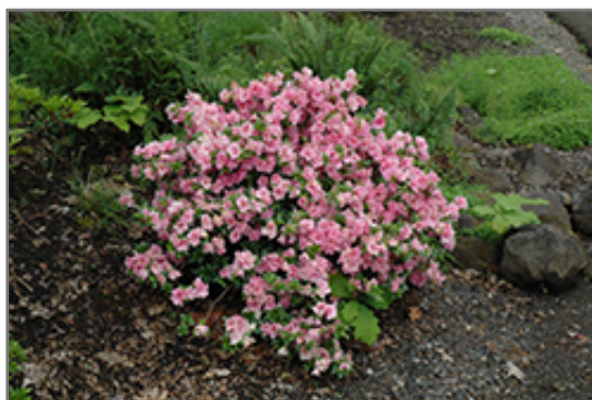
Gumpo Pink Azalea in bloom