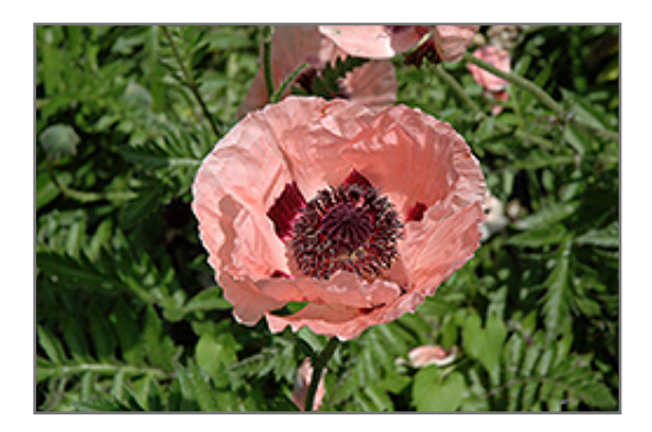
Cedar Hill Poppy flowers