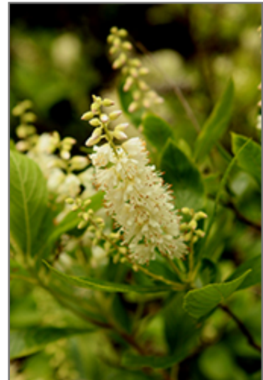
Summersweet flowers