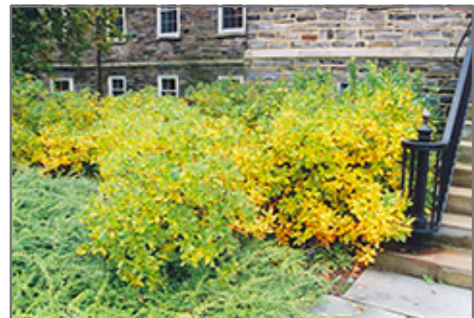
Summersweet in fall