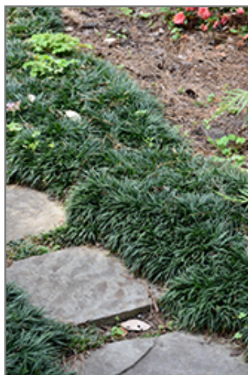
Dwarf Mondo Grass