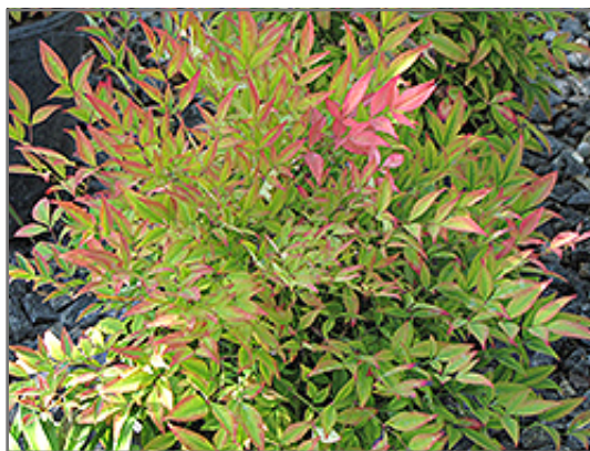
Moon Bay Dwarf Nandina