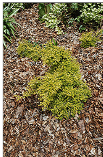
Baggesen's Gold Box Honeysuckle