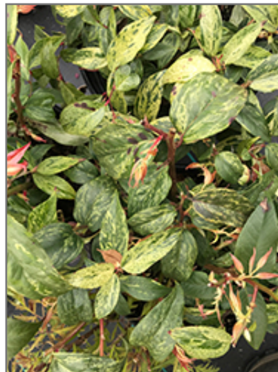
Rainbow Fetterbush foliage

This is a relatively low maintenance shrub, and is best pruned in late winter once the threat of extreme cold has passed. Deer don't particularly care for this plant and will usually leave it alone in favor of tastier treats. Gardeners should be aware of the following characteristic(s) that may warrant special consideration;