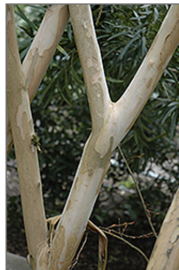
Zuni Crapemyrtle bark

Zuni Crapemyrtle makes a fine choice for the outdoor landscape, but it is also well-suited for use in outdoor pots and containers. Because of its height, it is often used as a 'thriller' in the 'spiller-thriller-filler' container combination; plant it near the center of the pot, surrounded by smaller plants and those that spill over the edges. It is even sizeable enough that it can be grown alone in a suitable container. Note that when grown in a container, it may not perform exactly as indicated on the tag - this is to be expected. Also note that when growing plants in outdoor containers and baskets, they may require more frequent waterings than they would in the yard or garden.