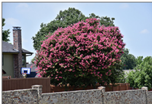
Zuni Crapemyrtle in bloom