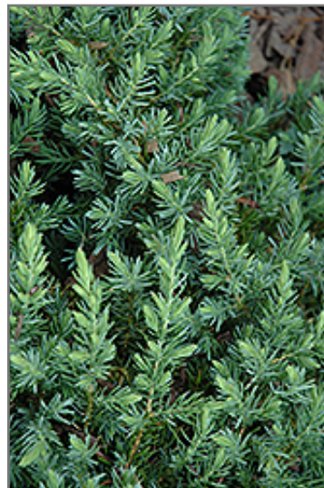
Blue Pacific Shore Juniper foliage

Blue Pacific Shore Juniper is recommended for the following landscape applications;