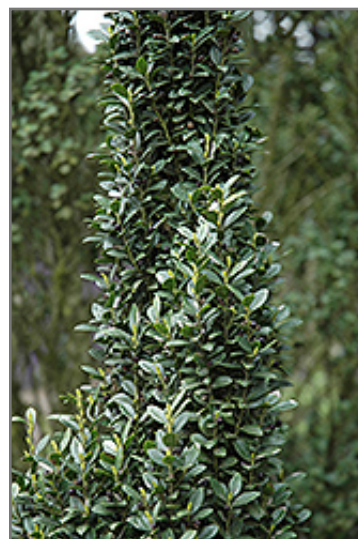
Sky Sentry Japanese Holly foliage