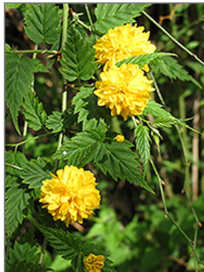
Double Flowered Japanese Kerria flowers