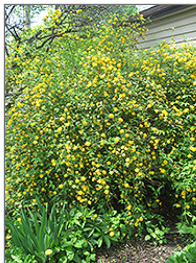
Double Flowered Japanese Kerria