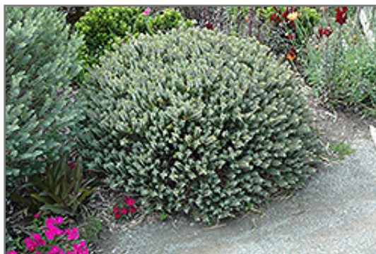
Red Edge Hebe

Red Edge Hebe is recommended for the following landscape applications;