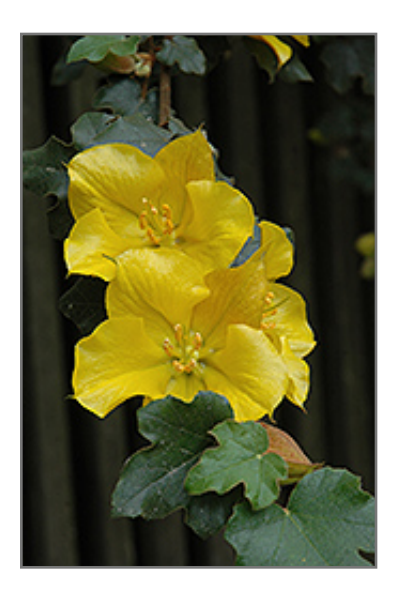
California Glory Fremontodendron flowers

This is a relatively low maintenance shrub, and should only be pruned after flowering to avoid removing any of the current season's flowers. It is a good choice for attracting birds and bees to your yard. It has no significant negative characteristics.