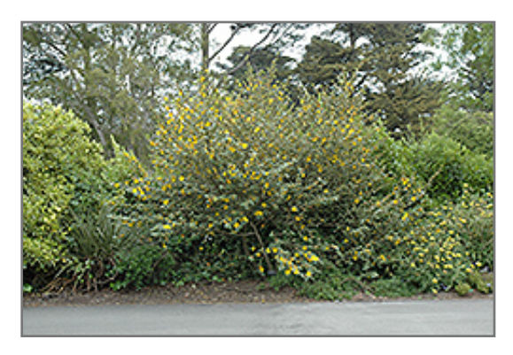
California Glory Fremontodendron in bloom