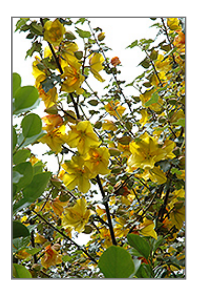
California Glory Fremontodendron flowers

This shrub should only be grown in full sunlight. It prefers dry to average moisture levels with very well-drained soil, and will often die in standing water. It is not particular as to soil pH, but grows best in sandy soils. It is somewhat tolerant of urban pollution. This particular variety is an interspecific hybrid.