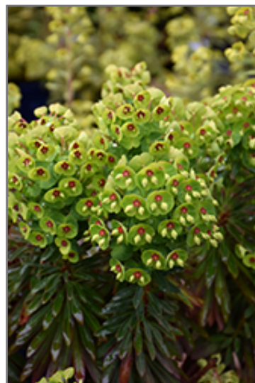
Tiny Tim Spurge flowers

Tiny Tim Spurge is recommended for the following landscape applications;