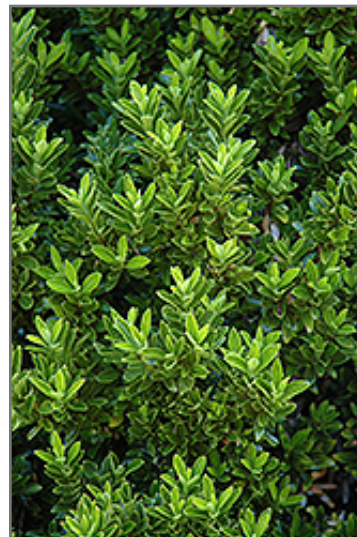
Boxleaf Euonymus foliage