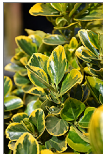
Gold Variegated Japanese Euonymus foliage

Gold Variegated Japanese Euonymus is recommended for the following landscape applications;