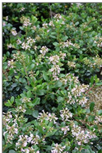
Pink Princess Escallonia in bloom