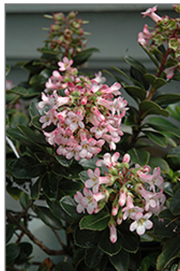
Pink Princess Escallonia flowers

Pink Princess Escallonia is recommended for the following landscape applications;