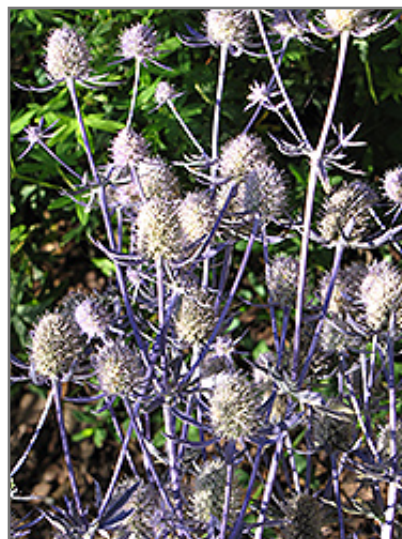
Jade Frost Variegated Sea Holly flowers

Jade Frost Variegated Sea Holly is a fine choice for the garden, but it is also a good selection for planting in outdoor pots and containers. It can be used either as 'filler' or as a 'thriller' in the 'spiller-thriller-filler' container combination, depending on the height and form of the other plants used in the container planting. Note that when growing plants in outdoor containers and baskets, they may require more frequent waterings than they would in the yard or garden.