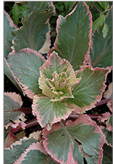
Jade Frost Variegated Sea Holly foliage