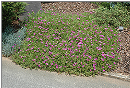
Purple Ice Plant in bloom

Purple Ice Plant is a fine choice for the garden, but it is also a good selection for planting in outdoor pots and containers. Because of its spreading habit of growth, it is ideally suited for use as a 'spiller' in the 'spiller-thriller-filler' container combination; plant it near the edges where it can spill gracefully over the pot. Note that when growing plants in outdoor containers and baskets, they may require more frequent waterings than they would in the yard or garden.