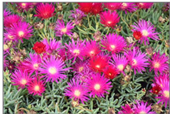
Purple Ice Plant flowers