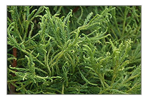
Spiraliter Falcata Japanese Cedar foliage

This is a relatively low maintenance shrub, and should not require much pruning, except when necessary, such as to remove dieback. It has no significant negative characteristics.