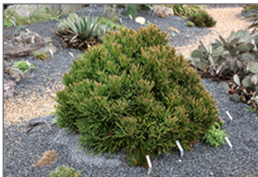
Little Diamond Japanese Cedar

Little Diamond Japanese Cedar makes a fine choice for the outdoor landscape, but it is also well-suited for use in outdoor pots and containers. It can be used either as 'filler' or as a 'thriller' in the 'spiller-thriller-filler' container combination, depending on the height and form of the other plants used in the container planting. It is even sizeable enough that it can be grown alone in a suitable container. Note that when grown in a container, it may not perform exactly as indicated on the tag - this is to be expected. Also note that when growing plants in outdoor containers and baskets, they may require more frequent waterings than they would in the yard or garden.