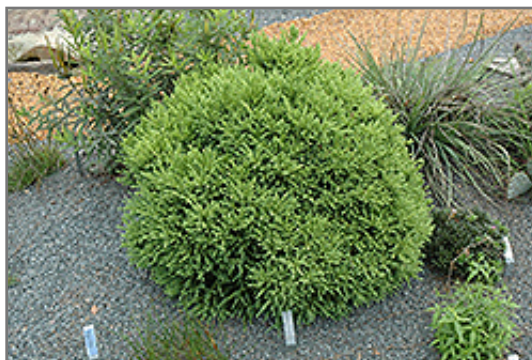
Little Diamond Japanese Cedar