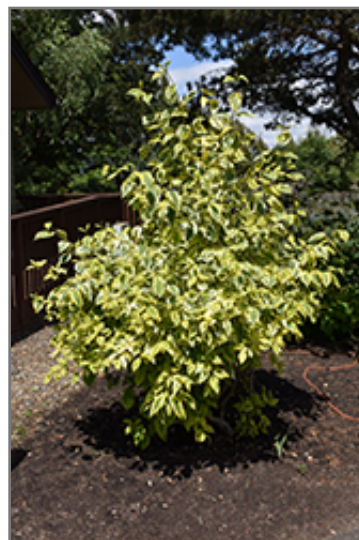
Hedgerows Gold Variegated Red-Twig Dogwood