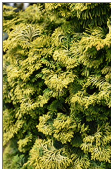
Dwarf Golden Hinoki Falsecypress foliage