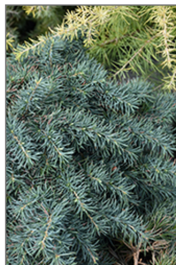
Prostrate Beauty Deodar Cedar foliage