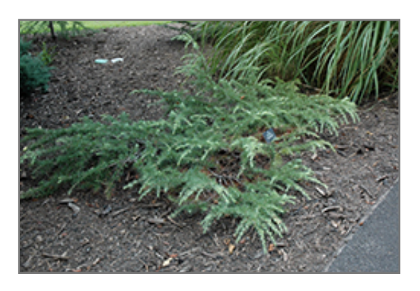
Golden Horizon Deodar Cedar foliage

An attactive tree with a dwarf pyramidal habit of growth, dense branches are covered with needles that emerge yellow and mature to yellow-green; best as an accent tree but can be pruned into irregular forms to compliment the conifer garden