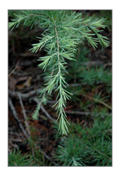
Golden Horizon Deodar Cedar

Golden Horizon Deodar Cedar is recommended for the following landscape applications;