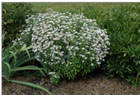
Jim Crockett Boltonia in bloom