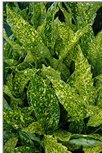
Variegated Japanese Aucuba foliage