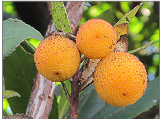
Strawberry Tree fruit

Strawberry Tree is recommended for the following landscape applications;