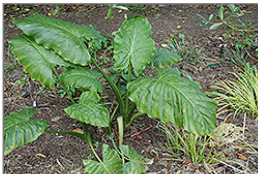
Elephant's Ear